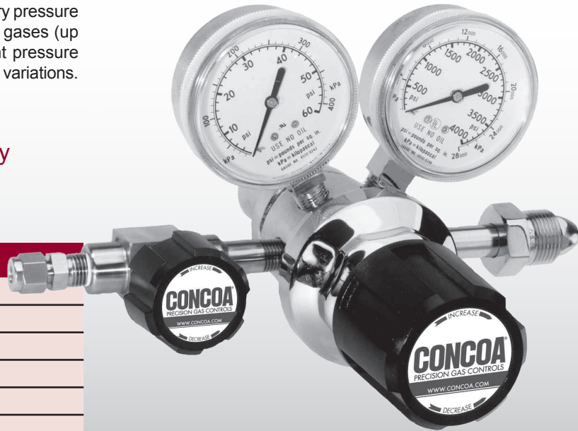
212 2331-580 shown